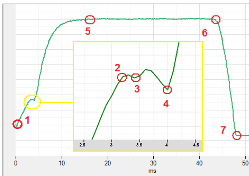
Figure 1. Opening (trip) coil current waveform with the zoomed part

supply, or some other supply (point 6). As the coil is de-energized, the current drops quickly to zero in accordance to the coil inductance (point 7) [1].